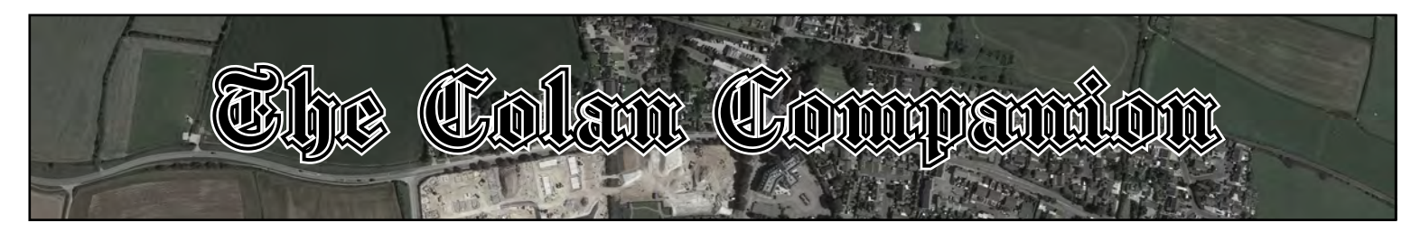
Issue 232 - March / April 2023